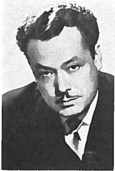
RAFAEL MENDEZ TRUMPET VIRTUOSO Hollywood, California